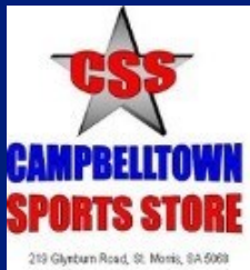
Under 14 JPL Team