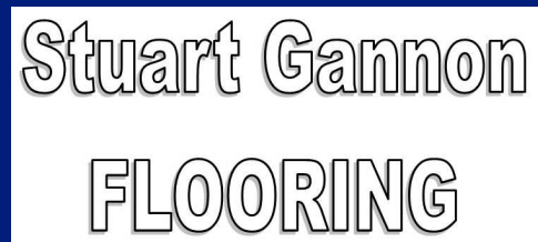
Under 16 JPL Team