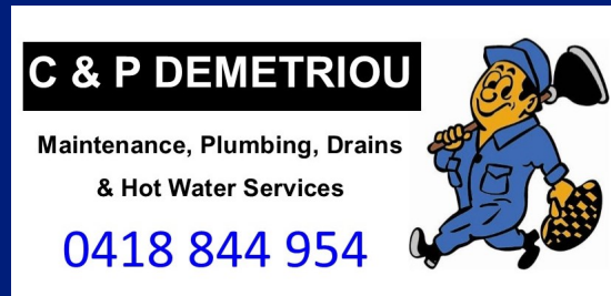
Under 12 JPL Team